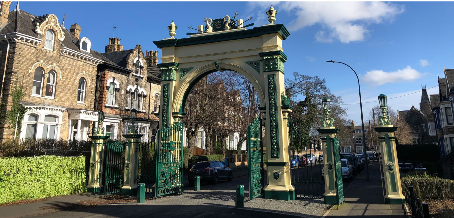
Pearson Park Arch